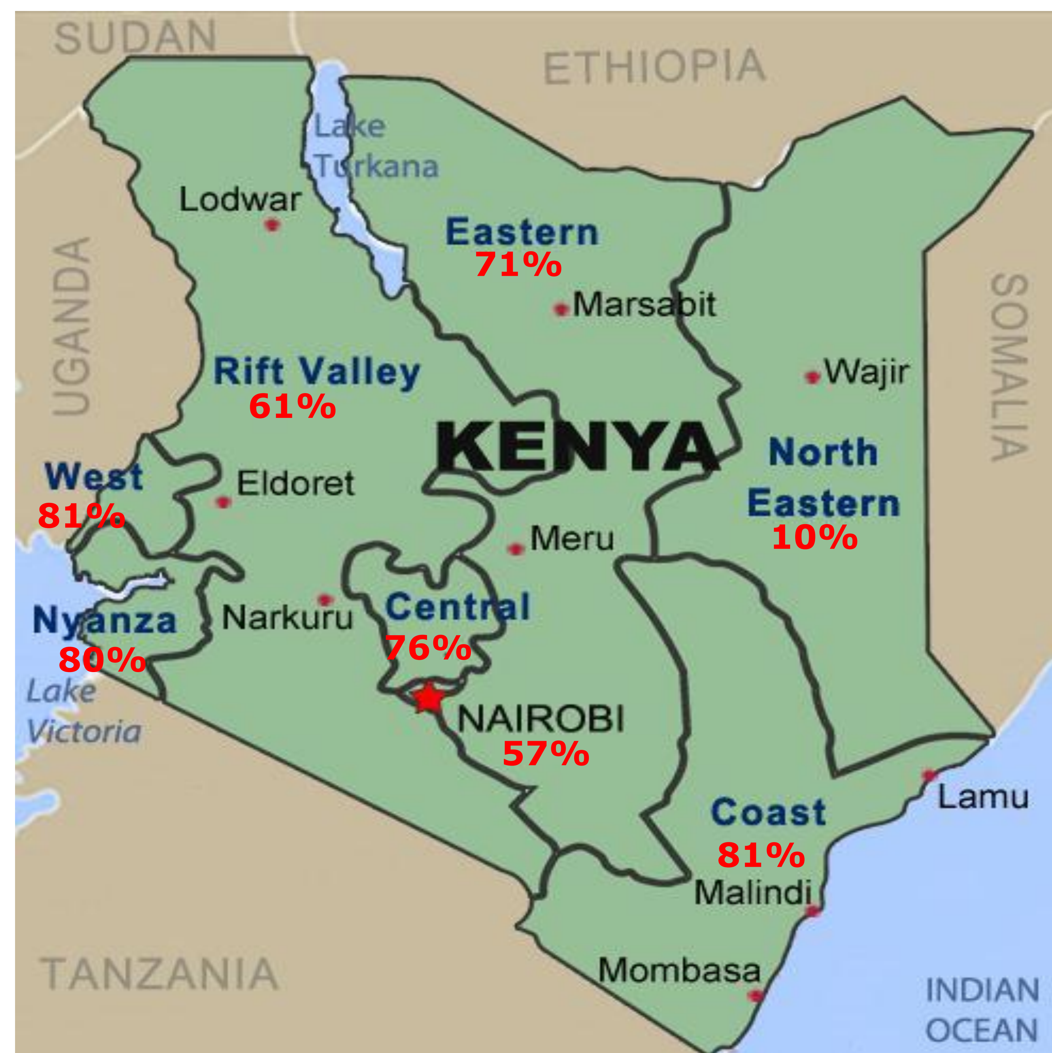
Percentage of Kenyan Respondents who Believe the Economic Status of their Household has Got Worse Over the Past Year (by Region)